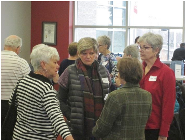
Social break during the November meeting

Thanks to everybody who has so far signed the Waiver of Liability before joining one or more of the thirty some activity clubs.