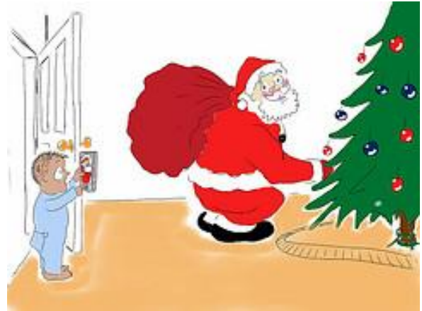
Get out your I-pad.