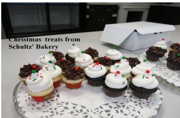
Christmas treats from Schultz' Bakery

We added to the festive spirit of Christmas by ordering in special cupcakes, even gluten free cupcakes, and healthy apples to accompany the coffee and tea.